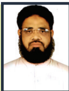
M.A. SALAM INDIA MA Islamic Studies